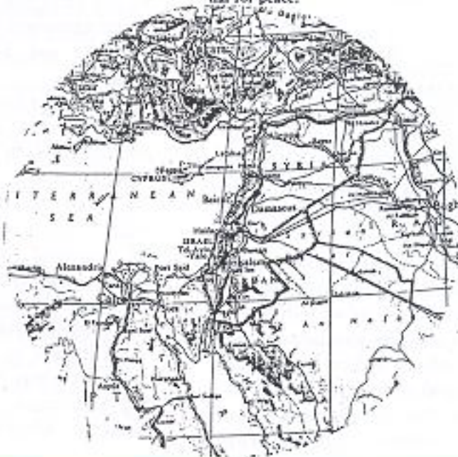
NILE - EUPHRATES CIRCLE (700 mile radius)

Peace and stability in the Circle of diversity (70-mile radius) requires an international awareness of the interrelated challenges of Demography-Environment-Regional Development. Regional cooperation must be evolved both in this circle and in the complementary Nile-Euphrates circle (700-mile radius). Prosperity, rather than stagnation and a widening income gap, is essential for peace.