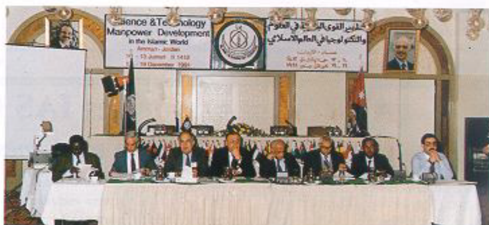
IAS General Assembly, in Session

The General Assembly discussed at some considerable length the finances of the Academy and approved means to support it financially.