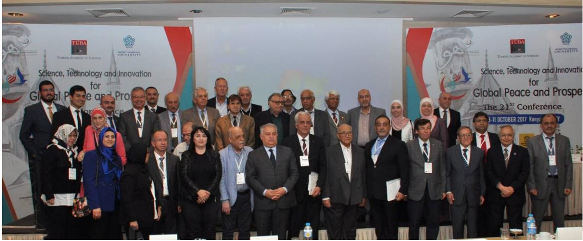
Some of the participants in the 21 st IAS Conference; Konya/ Turkey; 8-11 October 2017.