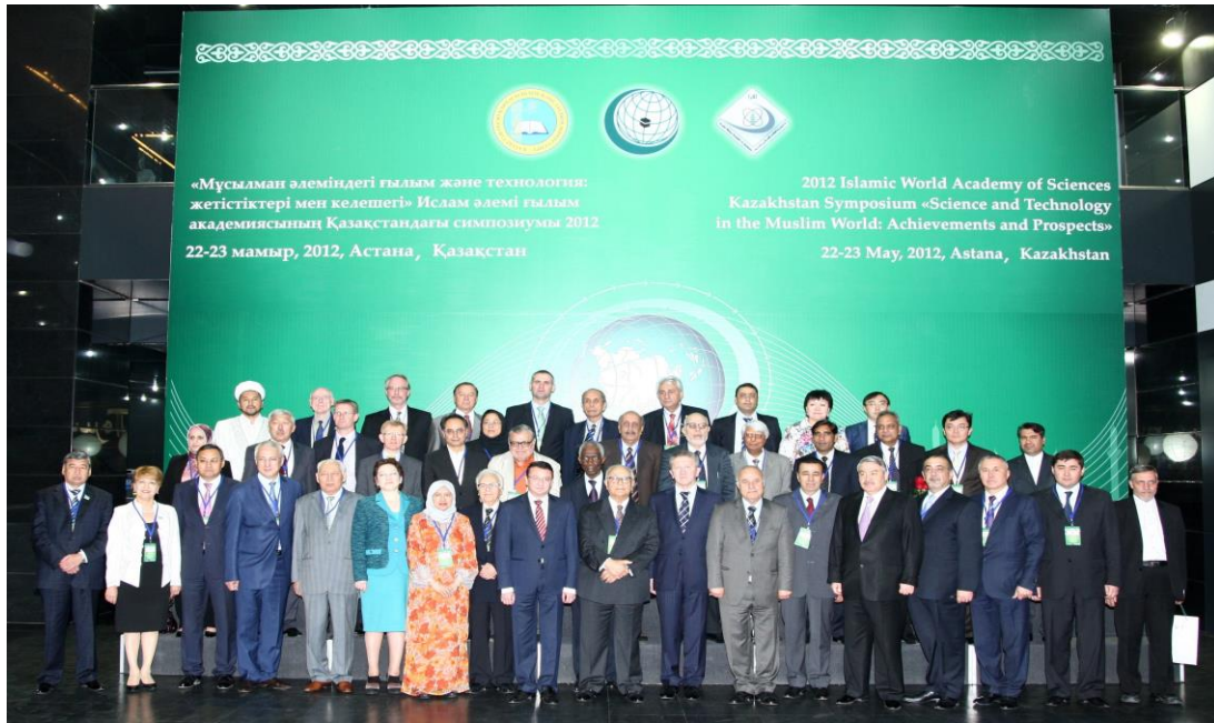
Some of the participants in the IAS Science Symposium; Astana/ Kazakhstan; 22-23 May 2012.